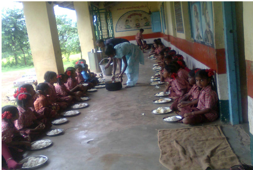
MDM: No discrimination observed