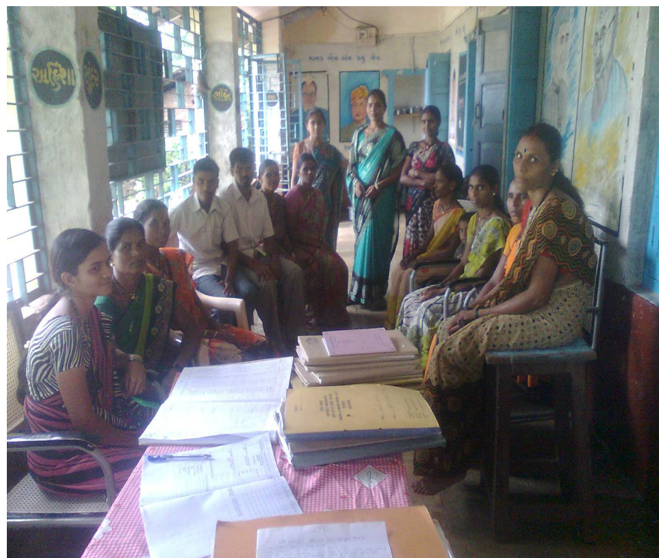
Community Awareness: Requires orientation