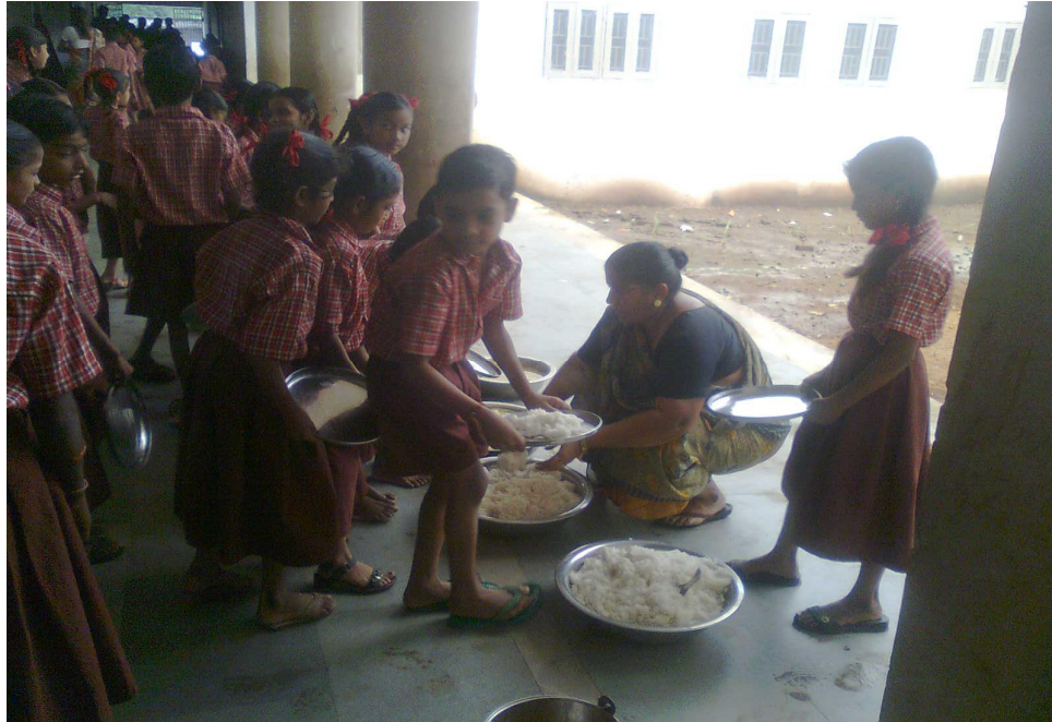
MDM: Children used to stand in queue to take the meal

The students were used to stand in queue and take the meals. The children either sat or stood in queue to take meal and then children used to sit in a row at school verandah. Then they use to recite a prayer and take the meals.